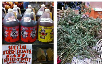
Figure 2. Baños are often composed of several plants and can be classified as either dulce (sweet) to attract good energy or amargo (bitter) to dispel negative energy or bad luck (left). Dried plant sample available at a botánica (right).