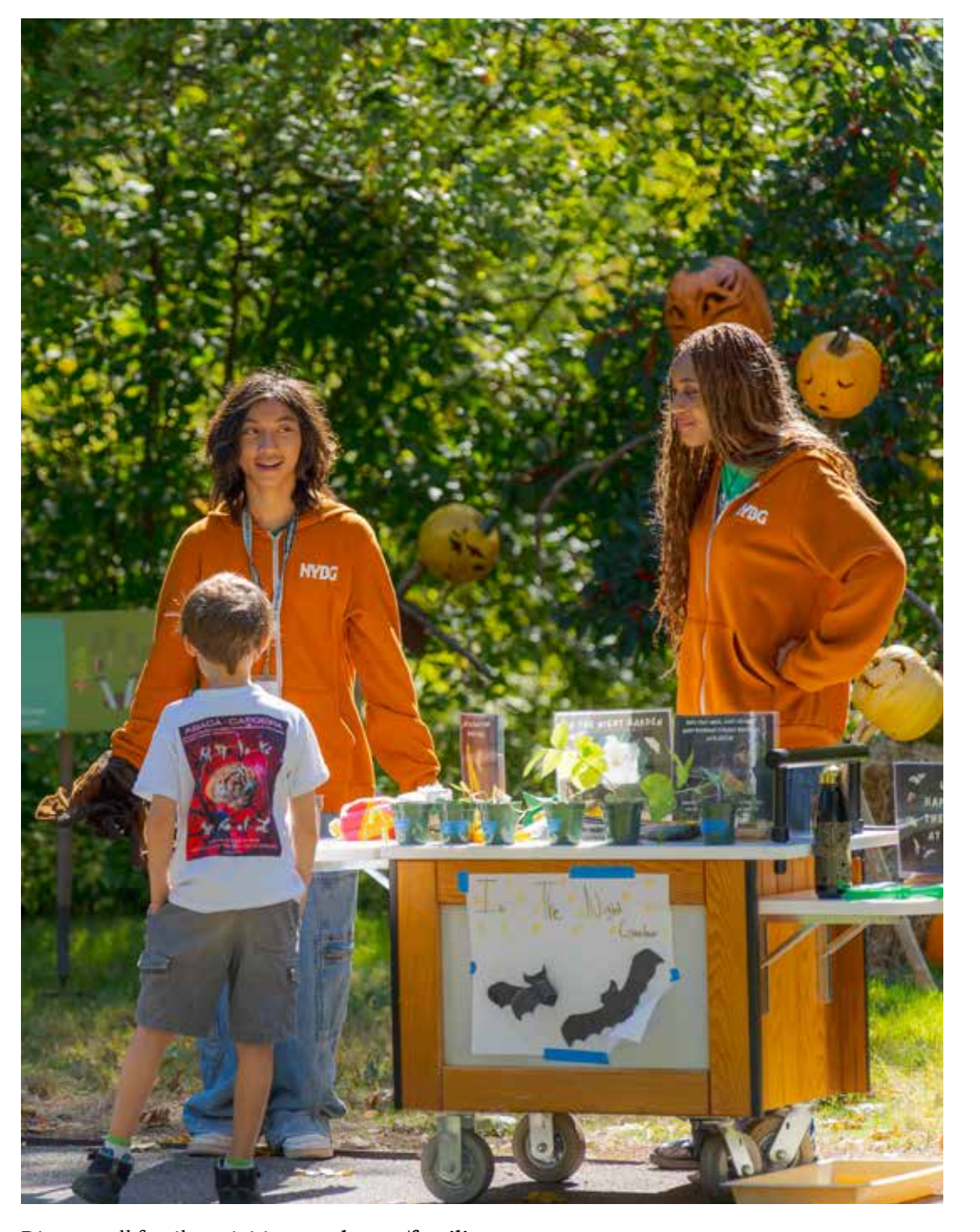
Discover all family activities at nybg.org/families

Every day at The New York Botanical Garden families can embark on an exciting adventure to discover the world of plants and to make lifelong connections with nature.