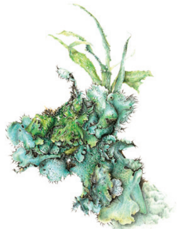
Verdigris, Scaled up 5:1, Colored Pencil, 2022 Graduate

In order to be considered for certificate completion, you must submit a final project, a body of work of consistent quality and style with a well-developed, cohesive theme and a competent use of medium. This project should be both a culmination of the foundation learned here at NYBG and a stepping stone into the larger world of botanical art. A project proposal must be submitted to the program coordinator in advance for approval.