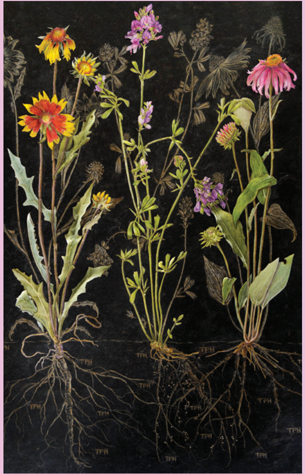
Gaillardia aristata, Medicago sativa, Echinacea purpurea, Mixed Media on Bitumen Paper

Contemporary botanical art captures the beauty of the natural world with precision, and our extraordinary instructors share their expertise in this nurturing yet rigorous program. NYBG offered North America's first formal botanical art certificate program, and has remained a leader in the discipline for more than three decades. Whether you're looking for personal enrichment or a professional credential, the NYBG Certificate is a prestigious indicator of mastery and accomplishment.