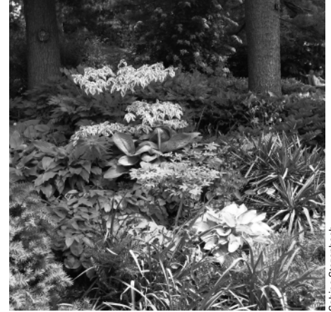
Shade perennials in the Perennial Garden

$31 non-members, $28 members Attend all three sessions and receive a 10% discount.